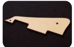
LG-PG (Cream) ¥15,750 Aged LP Pickguard