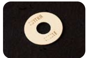
LG-TPC ¥4,200 50's Rhythm/Treble Ring / Cream