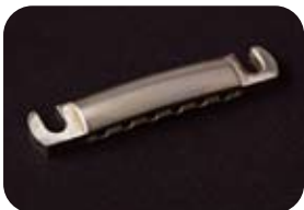
LG-TPA(Aged) ¥10,500 Light Weight Tailpiece / Nickel