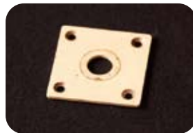
LG-JPC ¥5,775 Aged Jack Plate / Cream