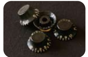
LG-HNB ¥7,875 Aged Top Hat Knobs / Black