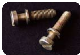
LG-TPS ¥4,725 Aged G-Type Studs Nickel