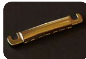
LG-TPG(New) ¥10,500 Light Weight Tailpiece / Gold