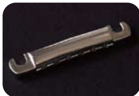
LG-TP(New) ¥8,925 Light Weight Tailpiece / Nickel