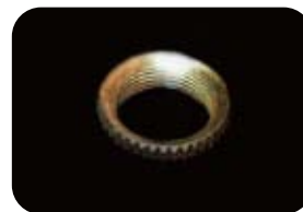
LG-TNUT ¥2,520 aged 50s Coarse Toggle Switch Nut