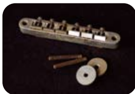
LG-BRC ¥18,900 Aged Nickel ABR-1 Bridge