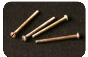
LG-PUS ¥1,680 Aged Slotted Head Hum-PU Adjustment Screws