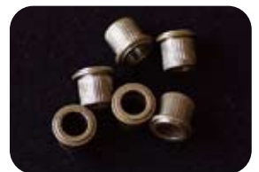
LG-CB ¥2,100 Aged Nickel Conversion Bushings