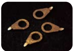
LG-PW ¥2,310 Aged G-Type Point Washer