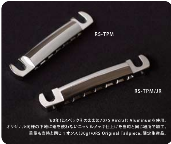
RS-TPM (new) ¥21,000, RS-TPM/JR (new) ¥23,100 RS Original Aluminium wrap Around Tailpiece / Nickel