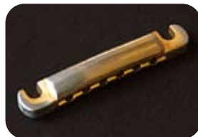
LG-TPGA(Aged) ¥13,650 Light Weight Tailpiece / Gold