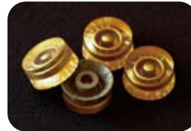
LG-SNG ¥7,875 Aged Speed Knobs / Gold