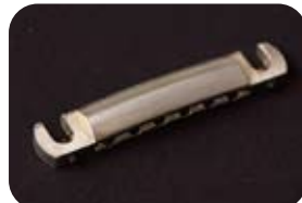
RS-TPMA (aged) ¥23,100 RS-TPMA/JP (aged) ¥25,200 Aged Model of LG-TPM & TPM/JR