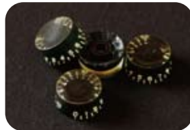
LG-SNB ¥7,875 Aged Speed Knobs / Black