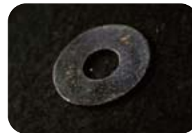
LG-TPB ¥4,200 50's Rhythm/Treble Ring / Black