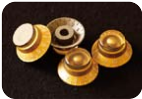
LG-HNG ¥7,875 Aged Top Hat Knobs / Gold