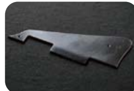
LG-PGC (Black) ¥8,400 Aged LP Pickguard